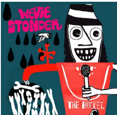
Wevie Stonder The Bucket Cack Records - 2009