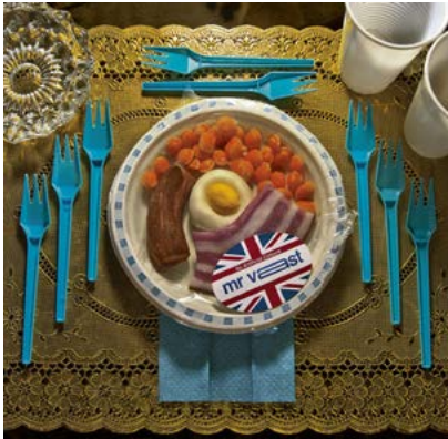
Mr Vast Touch and Go Cack Records - 2018