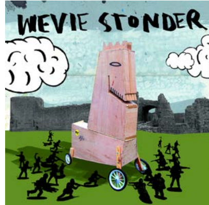
Wevie Stonder The Wooden Horse of Troy SKAM - 2005