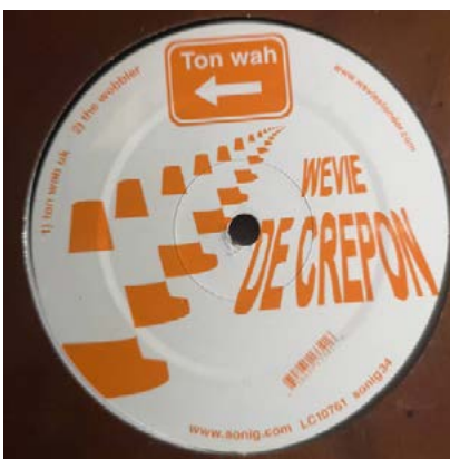
Wevie De Crepon Ton Wah - 2004